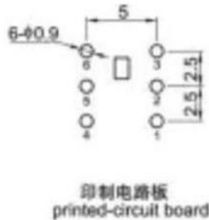
印制电路板 printed-circuit board